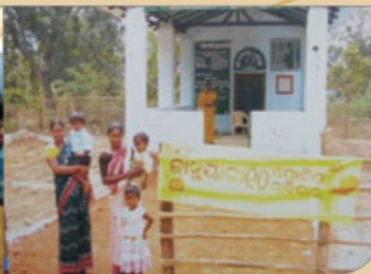
VSS Building used for Immunization