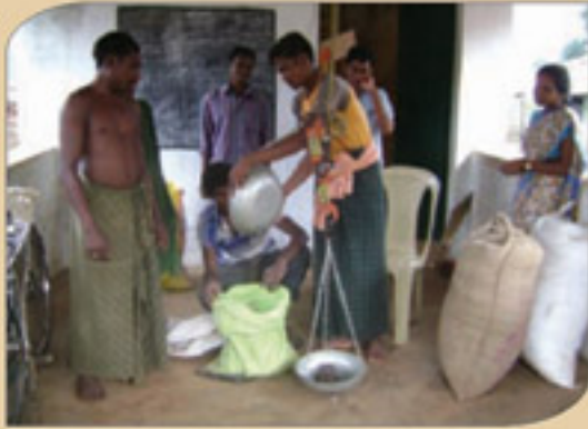
VSS Building used as an interim storing place