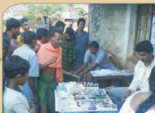
VSS Building used for Health Promotion