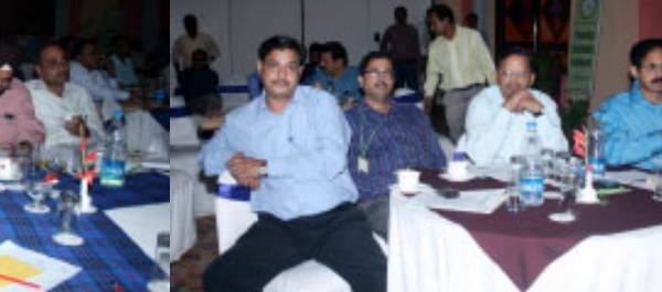
Delegates from other states